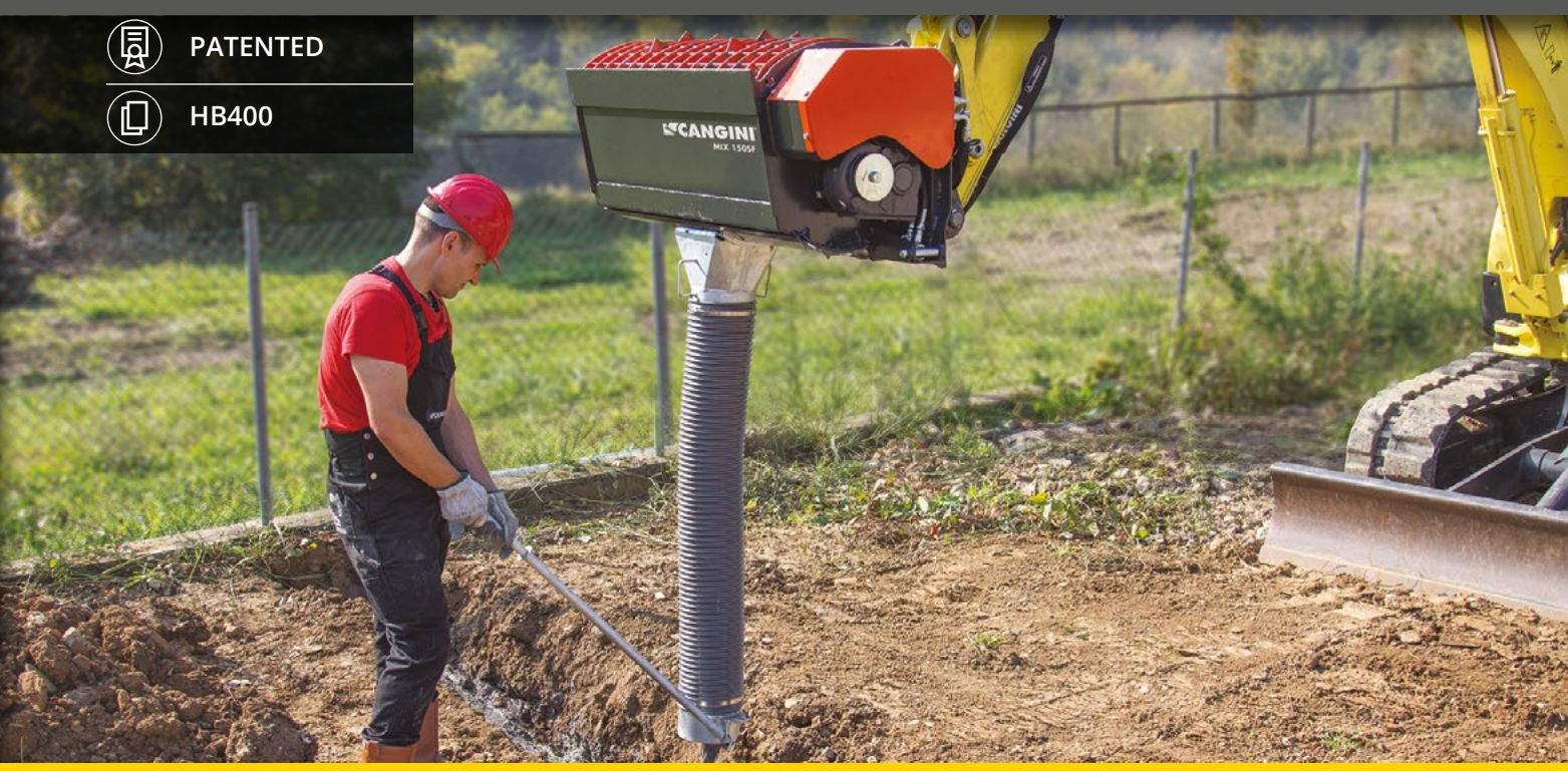
NB: AT THE TIME OF ORDER, PLEASE NOTIFY THE VOLTAGE OF THE ELECTRICAL SYSTEM (12-24 V)

GEARBOX TRANSMISSION DELIVERS HIGH PERFORMANCE AND IS ALMOST MAINTENANCE-FREE HIGH PERFORMANCES AND DOES NOT REQUIRE CONTINUOUS MAINTENANCE INTERVENTIONS, THE USE OF DUAL CROSS RELIEF AND FLOW DIVIDER VALVES GRANTS EFFECTIVENESS AND RELIABILITY EVEN IN THE MOST DIFFICULT WORK CONDITIONS.